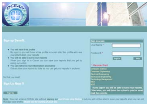
Figure 1. OCEAN Start up page

The Online Customization and Enrollment Application Network (OCEAN), developed in the School of Engineering at the University of Bridgeport is an interactive web-based application for graduate programs, concentrations, certificates and courses across the Schools of Engineering, Business and Education that allows prospective and current students to customize their preferences in the course selection process depending on