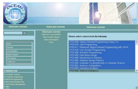
Figure 4. OCEAN Course selection page

After the selection of one of the provided options, the user is requested to select one or more of the preferred courses, concentrations, degrees and/or dual degrees. Fig. 4 depicts the list of current courses that are offered in the