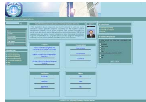
Figure 3. OCEAN Initial page

provides links to the course and concentration descriptions, and are altered randomly every time the page is reloaded (i.e., refreshed).