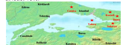
Exhibit 4. 16 ICAs and potential locations

The model is solved for different scenarios corresponding to different values of retreadable tire ratio. The results indicate that tire retreading increases the profit by at least 16.7% compared to conducting only recycling when the retreadable tire ratio is at least 10%.