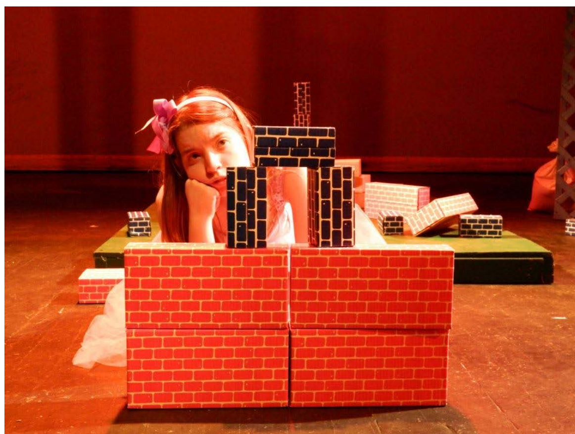
What Dreams are Made of! SUNY Purchase 2012