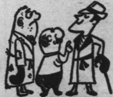
WARREN BODOW SYRACUSE