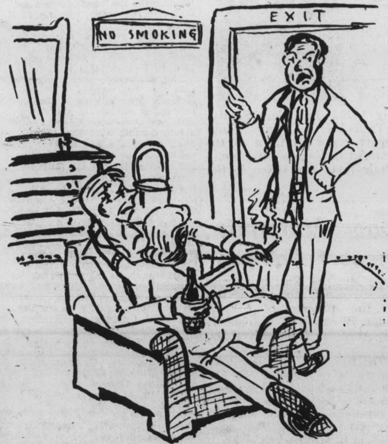
"How many times have I told you not to smoke in your room."

Let's not merely gripe. If you want action, see the proper authorities!