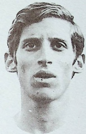
Alan Spindel Track