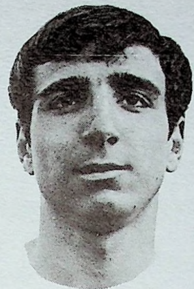
Bill Sciallo Track