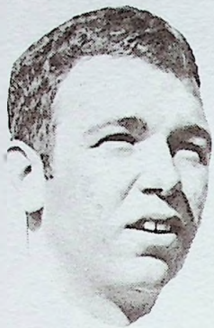
Dennis Empire Baseball