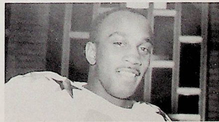
George Dixon '58, of the Montreal Alouettes, is the top pro football player in Canada for 1962!