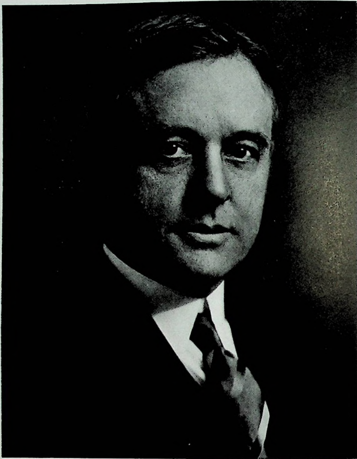
DR. ALFRED CIVILIAN FONES