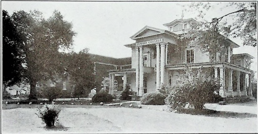
JUNIOR COLLEGE OF CONNECTICUT Bridgeport, Connecticut