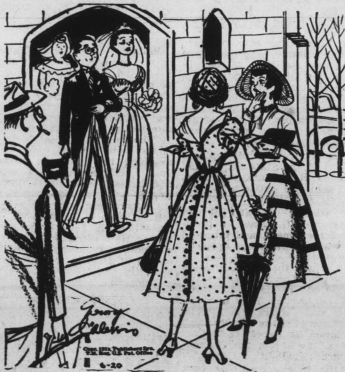
"Oh, she WANTED to be a June bride — but according to "Along Park Place" she was married last week!"

Don't be content to observe. Not only will you get that "good, clean fun" we've been hearing about for so long, but you just might enjoy yourself.