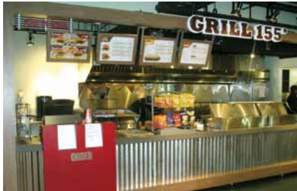
Above: Before and after at Marina: The air conditioned dining hall serves up views and an array of flavors.