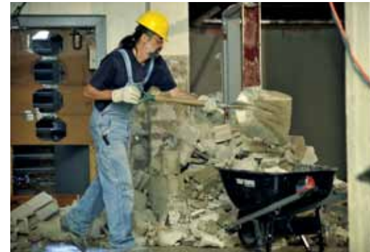
The Human Anatomy Lab at Eleanor Dona Hall was demolished then rebuilt with new scrub areas, large-screen monitors, and virtual dissection stations.