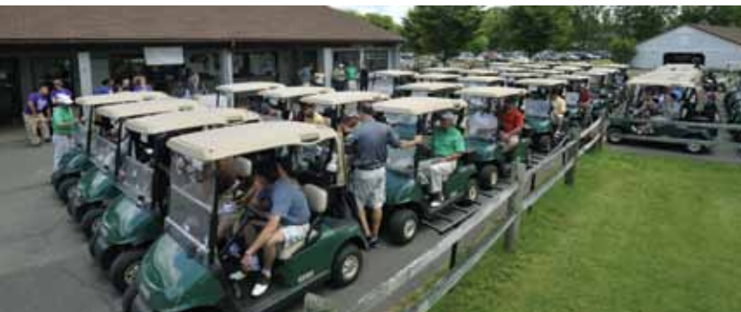
Participants get ready to tee off at UB's annual Golf Classic at Tashua Knolls Golf Course in Trumbull, CT, on June 13. The fundraiser, now in its 15th year, raised nearly $25,000 to support University athletics.