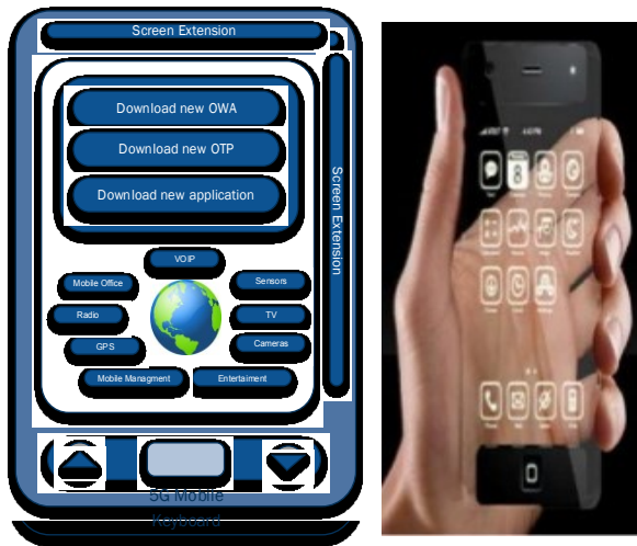
Figure3: Design of 5G mobile phone [16]

The upcoming smart applications such as Multimedia Messaging Service (MMS), wireless broadband access, HDTV contented, video dialog, Digital Video Propagation (DVB) and mobile TV, data and voice services ... etc are going to be used in 5G mobile phone design in order to