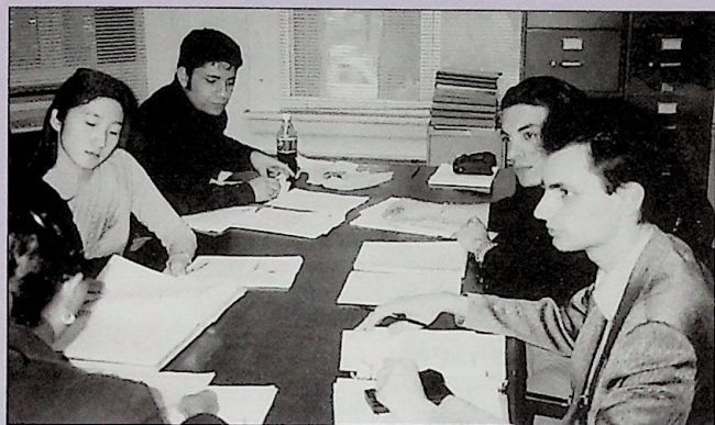
Students preparing for the 46th Harvard National Model United Nations.

Gurirab's speech was part of the 2000 Distinguished Guest Lectures Series, sponsored by UB's New England Center for International and Regional Studies. ■