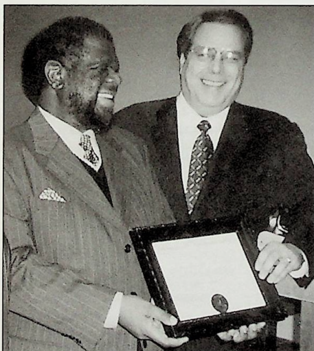
Dr. Theo-Ben Gurirab receiving the certificate naming him Honorary Fellow of the New England Center for International Studies.

"I am where the UN is and I am, in this new millennium, leading the UN, along with my brother and colleague (UN Secretary General) Kofi Annan, where it's going: towards a better, brighter and humane future for humanity," said Gurirab.