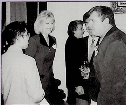
Alumni meeting at Waldemere Hall.