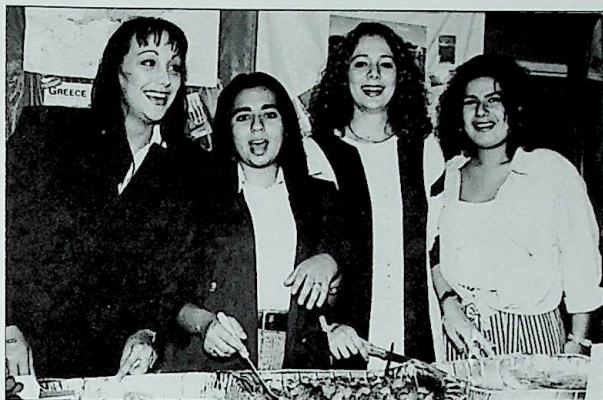
The Greek food was fantastic!

The gala evening included an international food experience, national dress show and performances by the students from the respective countries. When it came time to award the prizes, Taiwan (The Republic of China) won first place in both the " Best Food " and " Best Booth " categories. Judged on flavor and appearance, Taiwan award-winning food was " Rich Pineapple. " Saudi Arabia was second and Zimbabwe third.