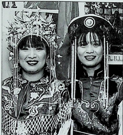
Students from Taiwan (Republic of China) display their native garb.

The theme, " Diversity is the Spice of Life. " was very much in evidence as students from 28 nations were represented with booths.