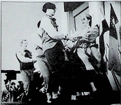
Lithuanian students enjoy their dance.

The Taiwan Booth, which featured students dressed as an emperor, queen, princess and bride, also won the first prize. Saudi Arabia was runnerup and Lithuania third. Malaysia won first place for the " Best Performance " with Japan and Indonesia second and third, respectively.