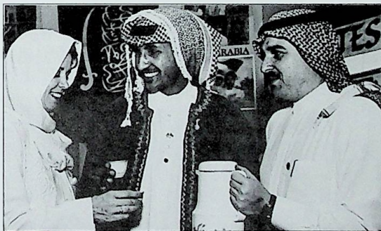
It's tea time in Saudia Arabia.

The gala evening included an international food experience, national dress show and performances by the students from the respective countries. When it came time to award the prizes, Taiwan (The Republic of China) won first place in both the " Best Food " and " Best Booth " categories. Judged on flavor and appearance, Taiwan award-winning food was " Rich Pineapple. " Saudi Arabia was second and Zimbabwe third.