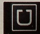
Uberpop fizzles in France p.6