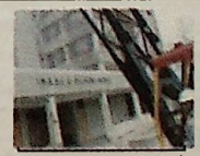
Development Plans for UB p.5