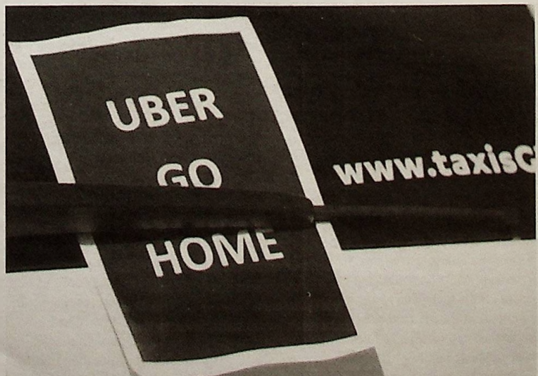
A leaflet which reads 'Uber go home' is seen on a taxi as striking French taxi drivers block the traffic on the Paris ring road during a national protest against car-sharing service Uber, in Paris, France, June 25, 2015.

Uber has really come under fire during the last couple of months. The protests being held by taxi drivers in New York as well as drivers in France do not bode well with the company. The arrests, fines, and new laws being passed are making it even more difficult for Uber to do anything without it being deemed an illegal service. The trial in September and what occurs after should greatly influence the company's next move.