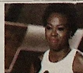
Viola Davis on Diversity p.3