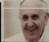
Pope Francis Visits U.S., p.3