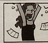
PHD Comics! p. 7