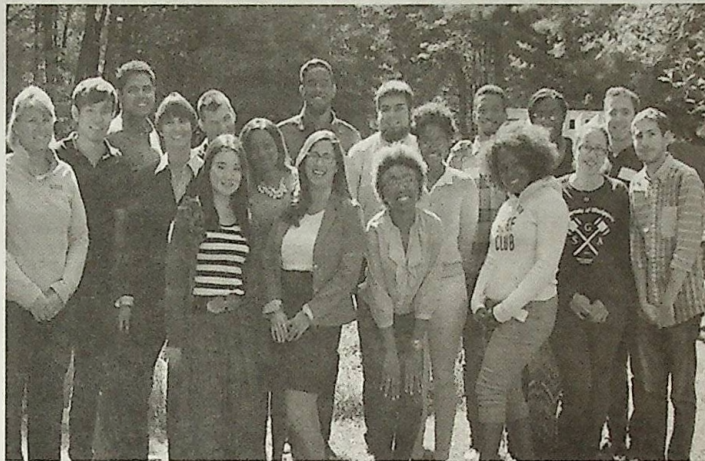
The members of the Student Government Association, circa 2014. Image sourced from their official website at bridgeportsga.com

With the new e-balloting system comes a host of positive and negative reviews. Students have remarked on how user friendly the student the system is for every-