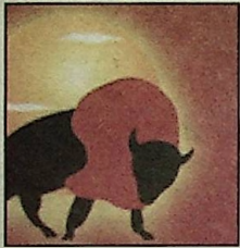
Topic Ten Pg 3