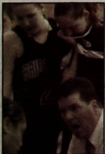
UB Sports Pg 8