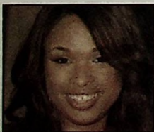
Entertainment Pg 5