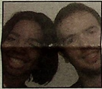
He Said She Said Pg 3