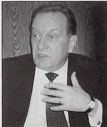
United Nations General Assembly president Harri Holkeri

tions system needs to be strengthened and reformed to carry out the tasks entrusted to it." He sees the need to develop the core strengths of the agencies as part of his legacy.